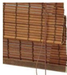
Tip stor roman